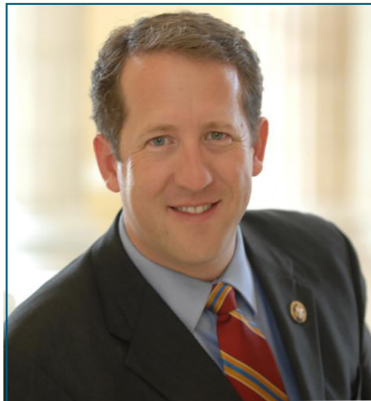
U.S. Representative Adrian Smith

Maintaining the valuable economic impact, scientific leadership and high safety standards of the American aviation industry are critical to continued success and innovation in American aviation.. ■