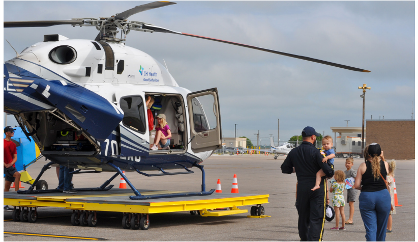
Above-Fly-In guests had the opportunity to tour the local hospital Air Care, Inc. helicopter on display.

Another top spotlight on our ramp was having UNK Aviation display one of their flight training planes. This program is led by Dan Smith and Captain Al Spain and attracts students from all over the globe. The eight Junior ROTC flight students were on site in their tactical jumpsuits to talk about their rigorous eight-week training program. These young adults are very impressive and eager to learn the aviation industry.