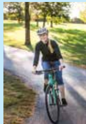
Pioneers Park Lincoln NE

Nebraska Tourism PO Box 98907 Lincoln NE 68509-8907 http://visitnebraska.com Phone 402-471-3796