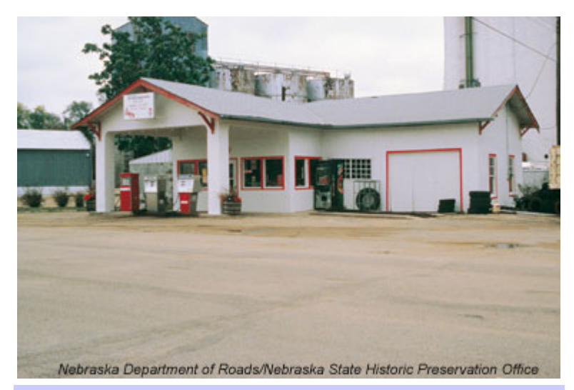
Thousands of historic properties, such as the Belvidere Filling Station along the Meridian Highway, were identified and evaluated during the survey.

The consultants drove thousands of miles to identify the historic routes and inventory the different types of road-related resources, such as buildings, objects, and structures. The survey focused on property types specifically associated with the historic transportation routes frequented by automobile tourists, including sections of early roads and waysides, bridges, gas stations, cabin courts and motels, diners and drive-in restaurants, and vintage tourist attractions. "Historic roadside resources, including gas stations and cabin courts, are quickly disappearing from our landscape," says Deputy State Historic Preservation Officer Bob Puschendorf from the Nebraska State Historical Society.