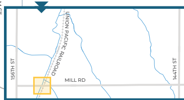
Inset shows area about 3 miles south of Louisville.

This public information open house meeting is being held to provide information regarding the proposed project. Attendees will have the opportunity to learn more about the project and ask questions to the project team. There will not be a formal presentation , and attendees may come and go at their convenience.