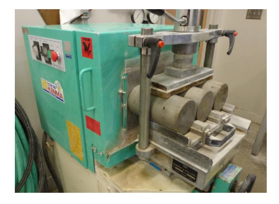
Figure 1. End Grinding Equipment