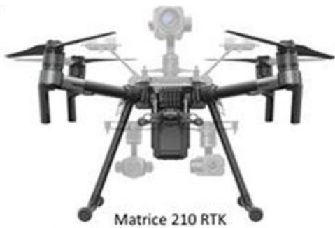
NDOT's Matrice 210 RTK Drone

Interested in finding out more? Final report is available at: NDOT Research Website