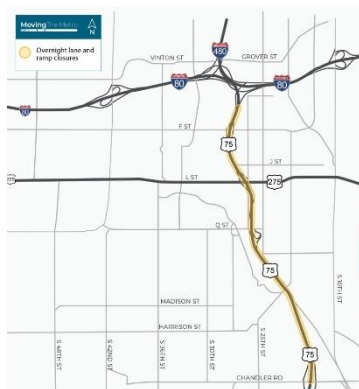
(larger map attached)