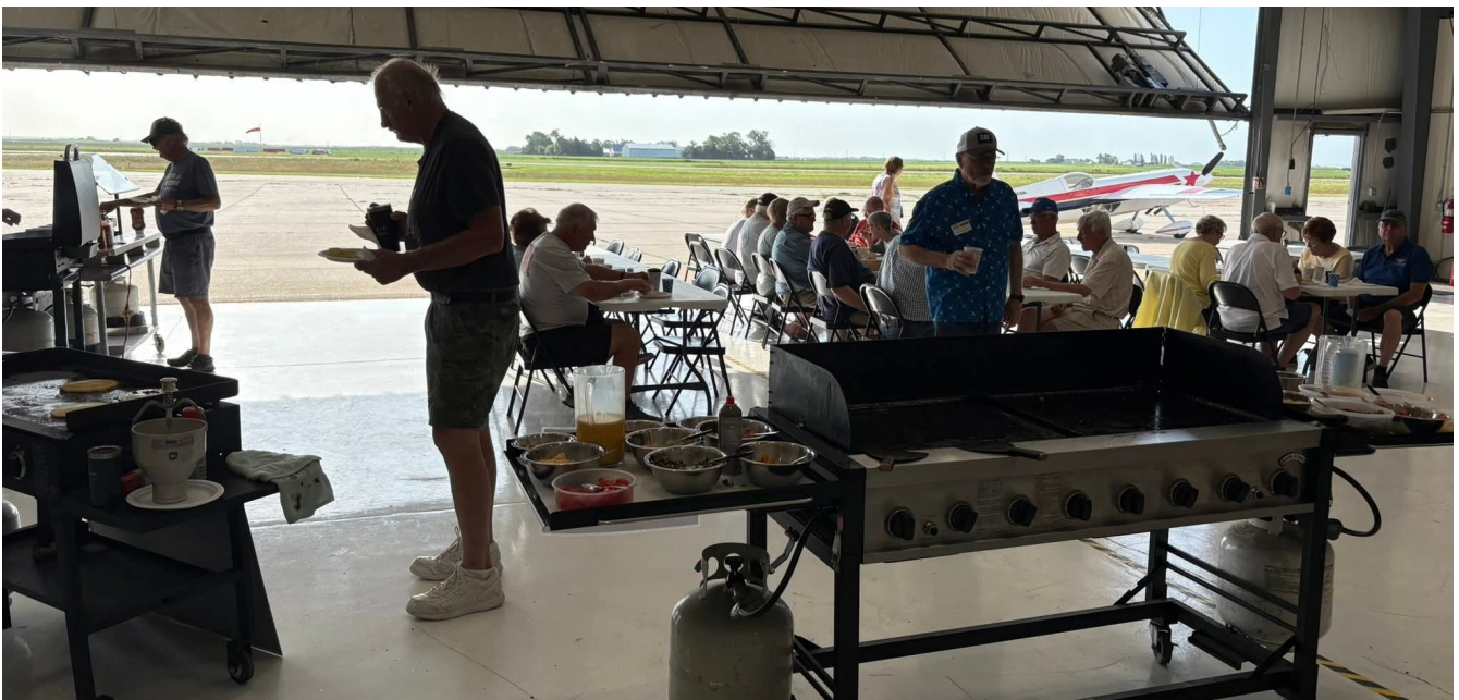
EAA chapter 569 members, friends, pilots, and aviation enthusiasts enjoying breakfast at monthly Fly-In and breakfast at Wahoo on June 21. ■