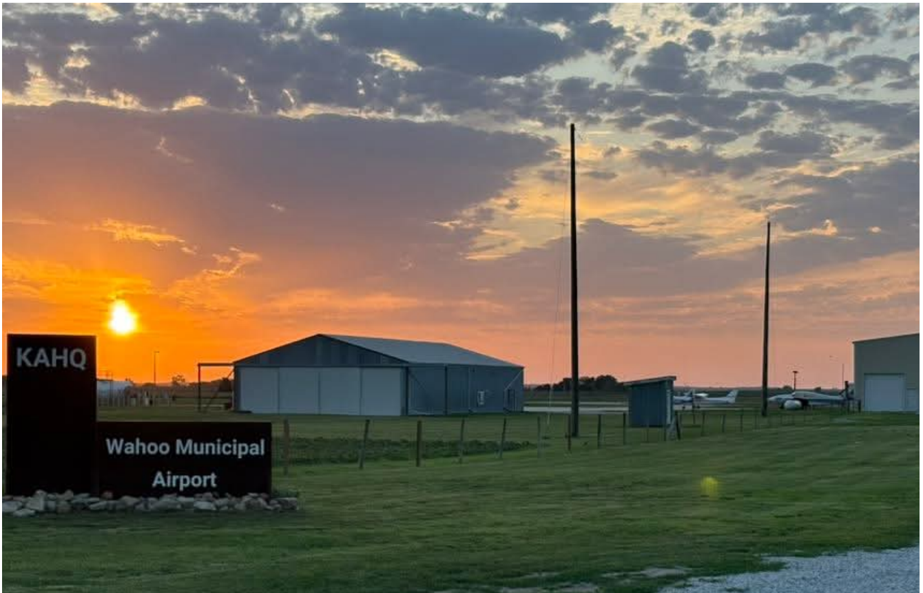
Sunrise ahead of the EAA chapter 569 monthly Fly-In and breakfast at Wahoo on June 21. ■

On the third Saturday of each month, EAA Chapter 569 members and friends gather for a morning of great food and conversation. Breakfast is served from 8 a.m. – 10 a.m. at the Wahoo Municipal Airport (KAHQ). Check out their website at www.eaa569.org and Facebook page at www.facebook.com/ea569 for more information. ■