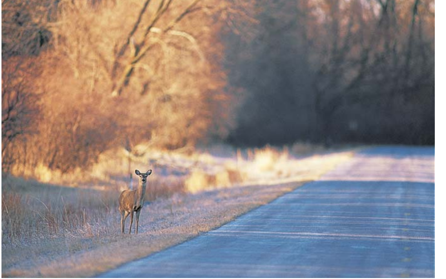
Unpredictable at best, a deer standing alongside the road is a potential hazard that all drivers should pay particular attention to.

In today's fast-paced society, deer carcasses are a common sight on Nebraska roadsides and illustrate the need for careful driving.