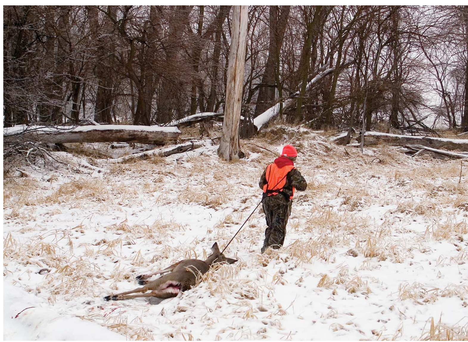
By increasing the doe harvest in parts of the state, the Nebraska Game and Parks Commission has reduced the deer population where crop depredation complaints and deer-vehicle accidents are high.

fall, meaning more people are traveling at dawn and dusk when deer are most active. Deer also do more running around during their fall breeding season. It's no wonder the collision count goes up during autumn.