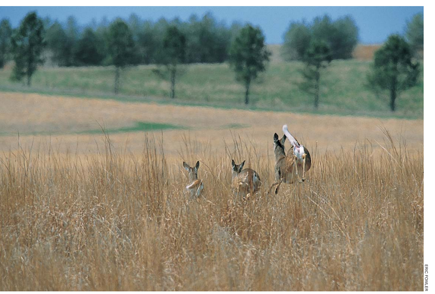
Social by nature, deer seldom travel alone. If you see one deer crossing the road, expect others to be with it.

A deer can appear in front of your car at any time of year, but most deer/vehicle collisions occur in autumn. When the fall crop harvest begins, deer's summer feeding and bedding patterns change and they move more often. Daylight grows shorter in the