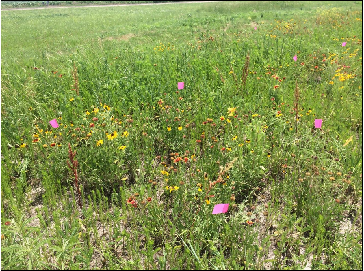
Figure 5. Wildflower island plot in Experiment 2 (Kearney, NE).