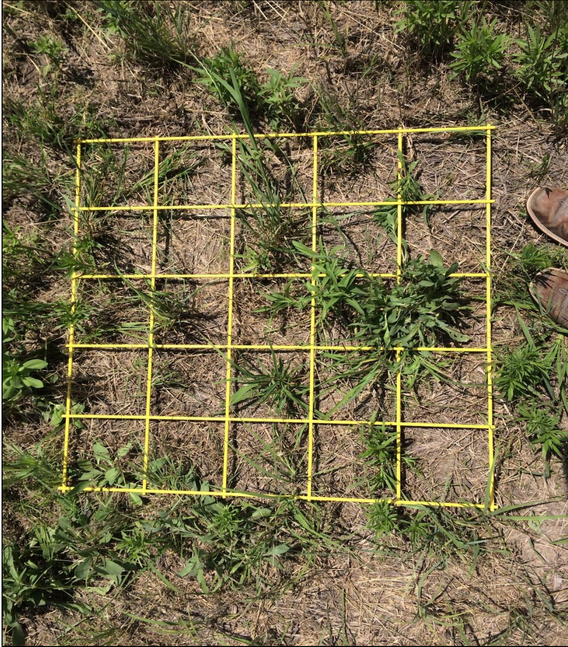
Figure 4. Frequency grid used for estimating frequency of occurrence in Experiment 1 (Kearney, NE).