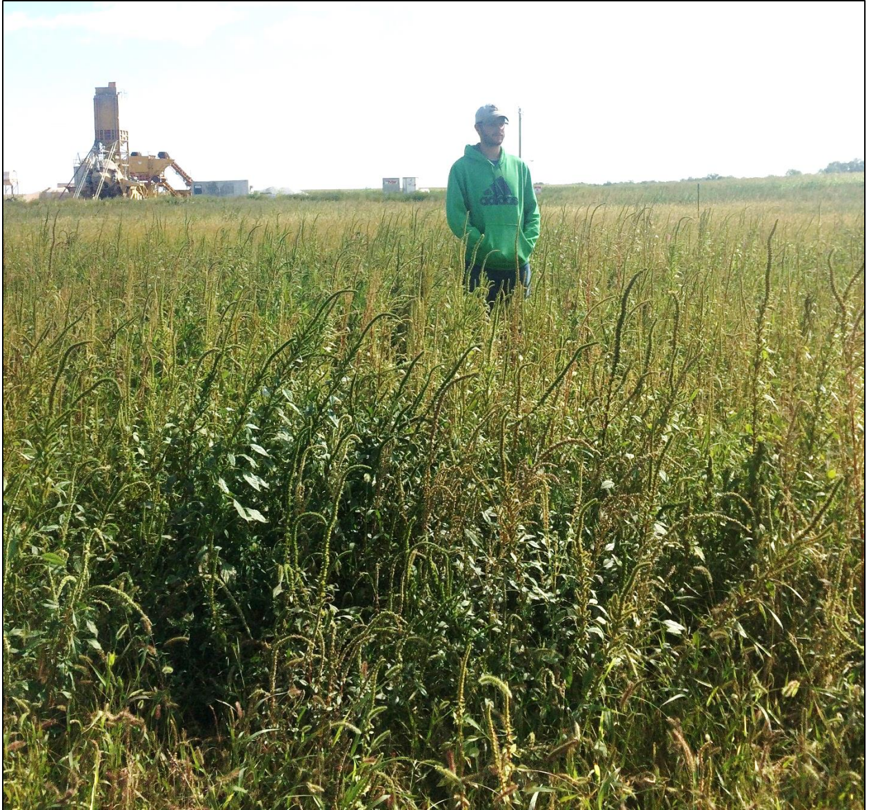
Figure 1. Growth of weedy forbs and grasses in September 2014 at Experiment 1 (Kearney, NE).