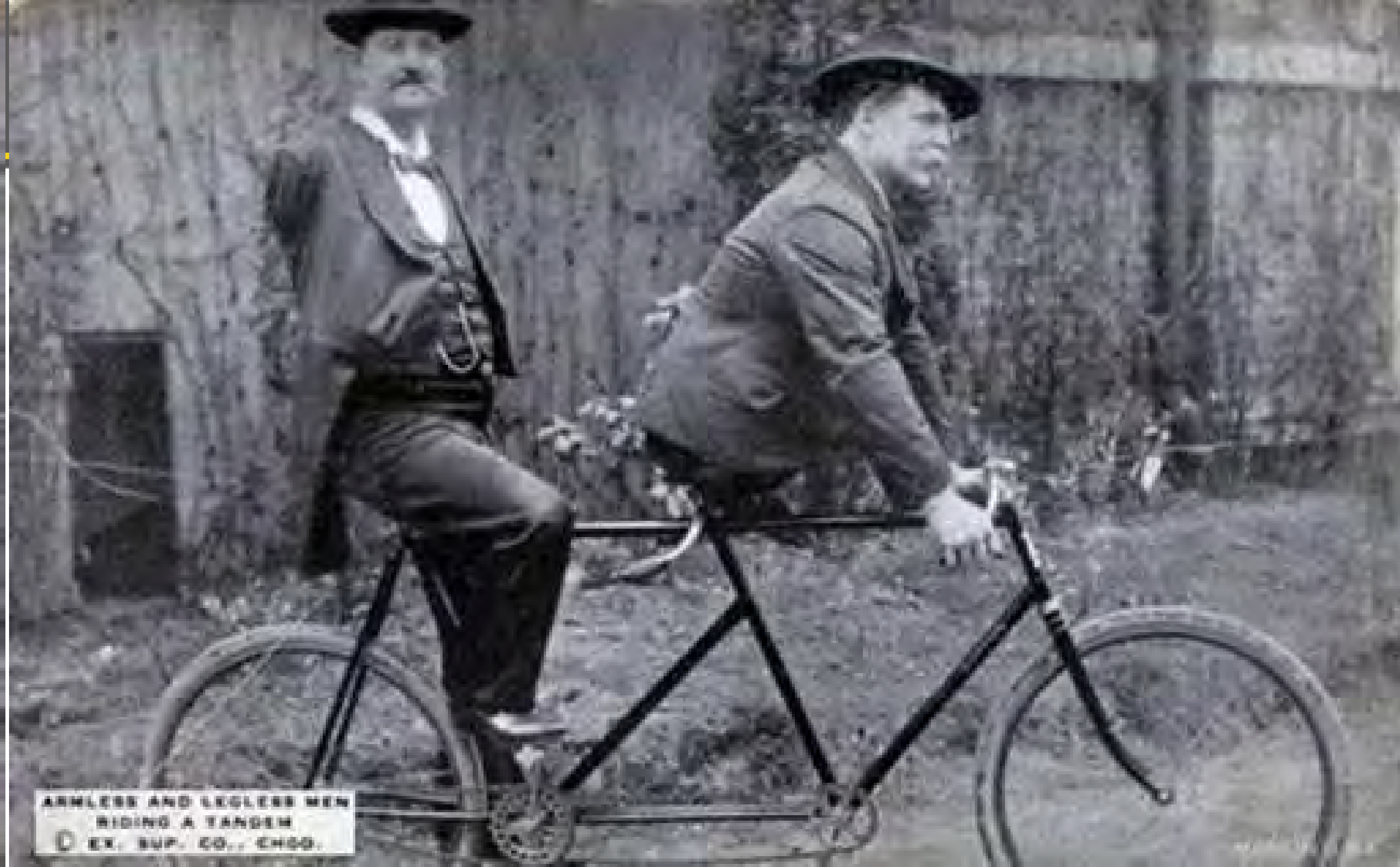
ARMLESS AND LEGLESS MEN RIDING A TANDEM