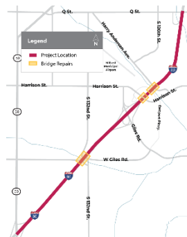
(larger map attached)

Traffic impacts include various temporary nighttime lane and ramp closures. There will also be lane shifts on I-80 that will remain in place until construction is completed. I-80 traffic will be reduced from 3 lanes to 2 lanes, resulting in significant delays.