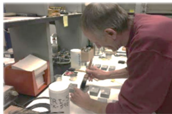
Figure 2. Sealer Application