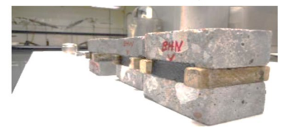
Figure 5. Concrete Blocks with Spacer Strips

This brief summarizes of In-House Research Project “Hot Applied Sealant Bond Test for Joints with Penetrating Sealers” Nebraska Department of Transportation Research Program