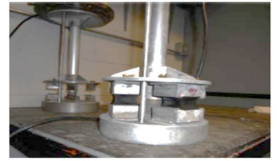
Figure 3. Concrete Blocks on Extension Machine