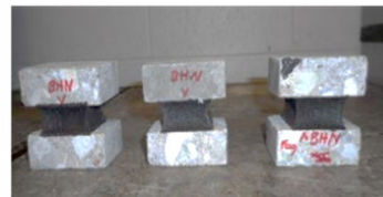
Figure 4. Concrete Blocks after 100% Extension – Visual Inspection