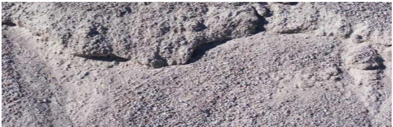
Figure 5. Recycled Crushed - Concrete Fines

The results show that the compressive strength of the soil with 3% RCC waste material did not cause a detrimental effect to soil modification. Figure 5. shows a typical stockpile of RCC fines produced from crushing operations. The Department of Roads has limited the amount of fines to be used as base course, due to potential drainage problems. When the concrete to be crushed is severely deteriorated the amount of concrete fines could be high; this may cause the Contractor to haul concrete fines to a landfill for disposal.