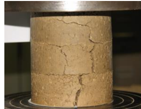
Figure 4. Failure pattern typical of brittle specimens.

Atterberg Limits (LL, PL, PI), percent retained on the #200 sieve, Maximum Dry Density and Optimum Moisture Content, and Unconfined Compression ( q_u ) tests were performed in order to evaluate the mechanical properties. These tests were performed on all soil mixture combinations proposed in this research and are provided in Table 4. It is observed that the addition of the 3% waste RCC had a minimal effect the LL, PL, and PI, Maximum Dry Density and Optimum Moisture content for all the soil types except for the High PI soils where the Optimum Moisture decreased 1 to 2 percentage points. When lime was added the LL, PL, and PI, and Maximum Dry Density and Optimum Moisture content results changed as would be expected. When evaluating the unconfined compressive strength ( q_u ) results with the addition of RCC and compared to the original soil, the key findings were found as follows.