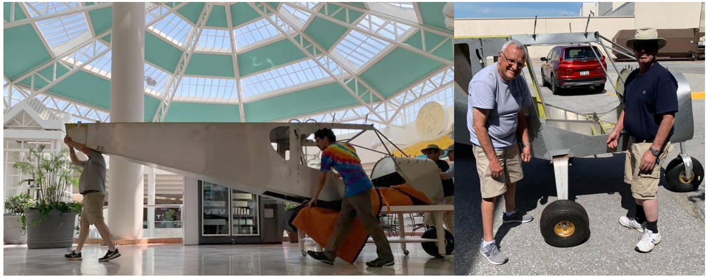
EAA Chapter 80 members assist in moving plane to new ABLE ACE facility at Oak View Mall.

Experimental Aircraft Association (EAA) Chapter 80 in Omaha, Nebraska recently partnered with a very generous mall owner and leased over 4,500 square feet of space in the Oak View Mall, 144th and Center, in west Omaha. The goal is to finish work on a partially completed Zenith 750 with Corvair engine that was donated to the chapter as an IRS 501(c)3 charitable organization donation.