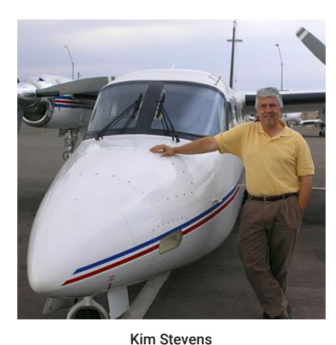
The business of "State Aviation" has opened a lot of doors for me over the years, and many of those doors have been attached to an amazing number of aircraft – both large and small, classic and vintage – some unique.

Although, as much as I'd like to talk about airplanes, I must mention