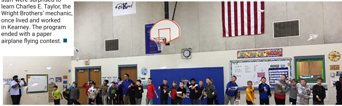
Paper airplane contest in the Meadowlark Elementary gymnasium.

Students construct paper airplanes for a contest.