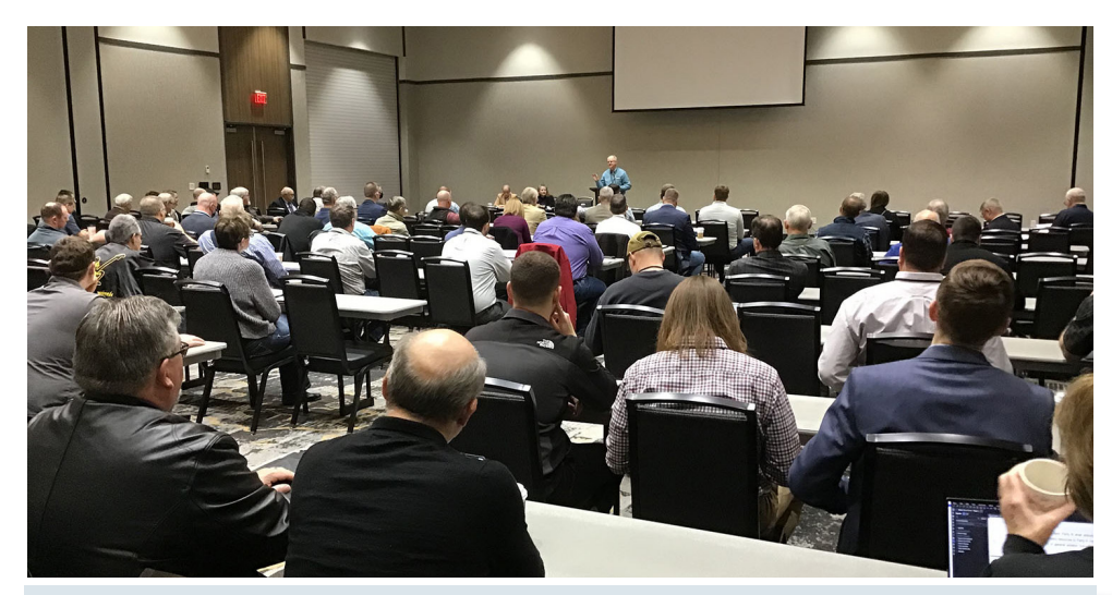
The 30th Annual Nebraska Aviation Symposium was held at the new and beautiful Crown Plaza in Kearney (EAR).

A year after the 29th Nebraska Aviation Symposium being canceled due to COVID-19 concerns, the 30th Annual Nebraska Aviation Symposium was held at the new and beautiful Crown Plaza in Kearney (EAR). There were numerous comments from attendees that this event was absolutely "great and well organized." These comments were well founded considering the schedule changes that had to be made due to the Federal Aviation Administration (FAA) personnel not being able to attend. As is always the case, the Nebraska Aviation Council (NAC) put together an outstanding event.