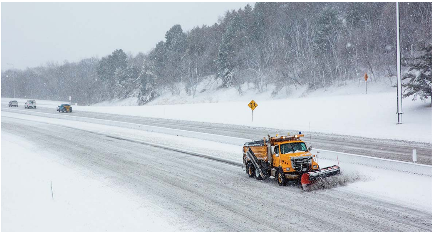
Plowing the snow on I-680 in Omaha, near the Pacific Street Interchange.

The decision was made as part of a unified effort between the highway districts affected by the blizzard and the operations center in Lincoln, as Roads officials monitored conditions across the state and around the clock.