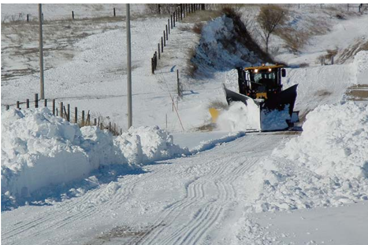
Motor grader with a "V" plow attached widens N-18, east of Stockville, in District 7.