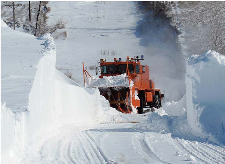
Rotary blower opens N-18, 13 miles east of Stockville in District 7.

District 7, which includes the McCook area, had several road closures, including US-6 between McCook and Cambridge, and a stretch of highway near Stockville, due to drifts as high as 12 feet, according to District 7 Engineer Kurt Vosburg. He noted that when their normal equipment was unable to open the road, a specially-equipped snow blower was dispatched to the area to get the job done. Ray Walrod, Highway Maintenance Supervisor in Imperial, said they were able to keep area highways open throughout the storm, with