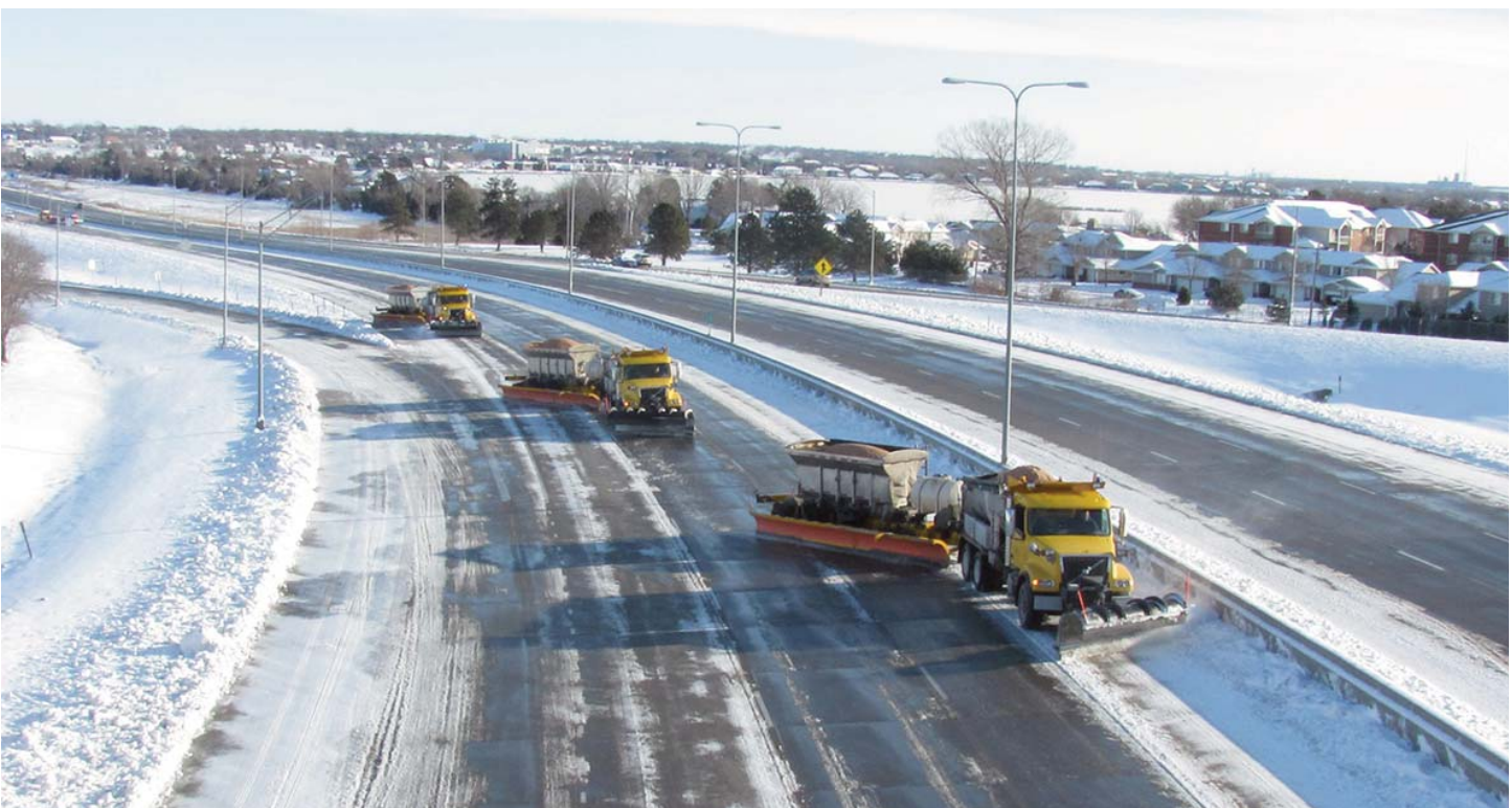
Three tow plows make their way along I-80, just east of the South US-77 interchange, headed west to Grand Island to help with snow removal operations.