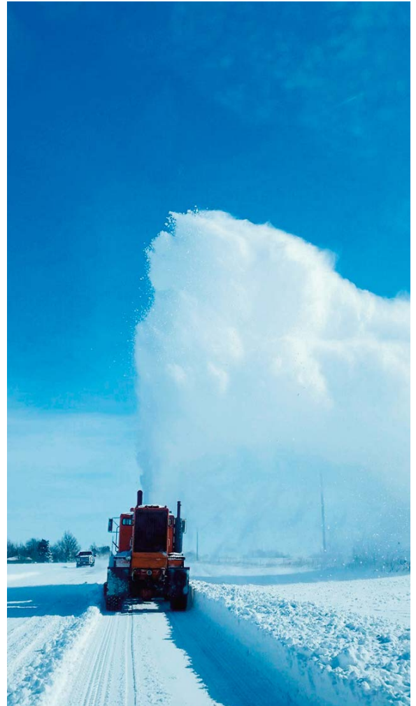
A rotary blower clears snow on District 1 highways, including, (top left) N-92 near Wahoo; (right) N-92, between Brainard and N-15, south and east of David City; (bottom left) Junction of N-92 and US-81, headed toward Columbus.