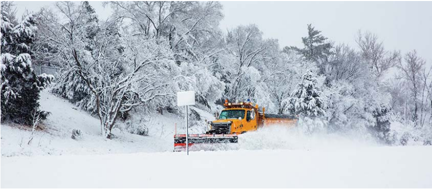
Snowplow forges a path on the I-680 off-ramp to Pacific Street in Omaha.