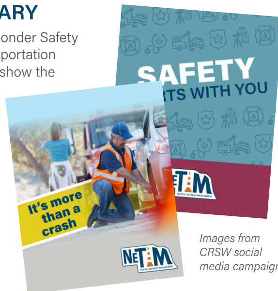
Images from CRSW social media campaign