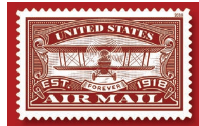
Airmail service played a key role in the development of our national airport system.

Even earlier, North Platte played a significant role in aviation history by hosting the first night airmail flight on February 22, 1921. Originally called North Platte Field, it was built and funded with private money. That night sky was ablaze from light created by fires in fuel barrels for the 7:48 p.m. landing. After refueling and a few repairs, the airmail pilot flew off at 10:44 p.m. to Omaha.