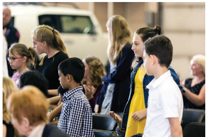
Attendees of the Aeronautics Aviation Contest look on as individuals are presented their awards.

The International Aviation Art Contest encourages engagement with aeronautics through art. The annual contest has been hosted by the Federation Aeronautique Internationale since 1989.