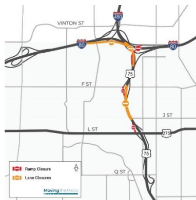
(larger image attached)