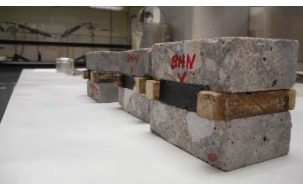
Figure 5. Concrete Blocks with Spacer Strips