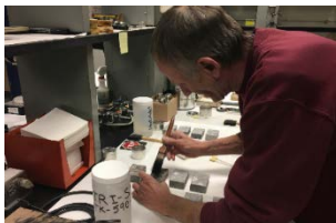
Figure 2. Sealer Application