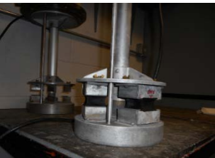
Figure 3. Concrete Blocks on Extension Machine