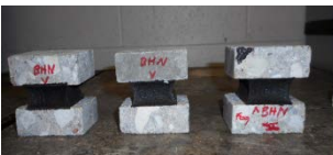
Figure 4. Concrete Blocks after 100% Extension — Visual Inspection