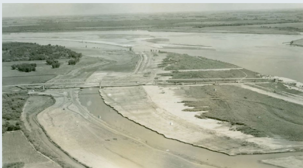
Photo: Partially completed bridge & USACE excavation, 1955.