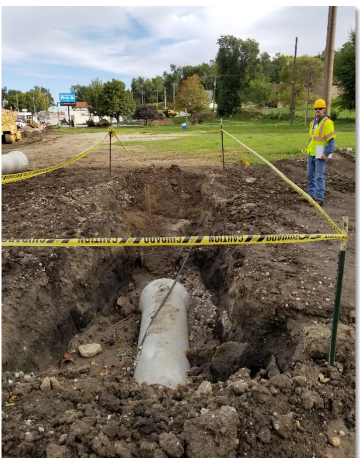
Pictured: Crews find contaminated soil at a project in Bennington, NE.

The UWAP is designed to help NDOT field staff identify, document, and mitigate unexpected waste discovered within the limits of construction. The UWAP outlines the proper procedures, the chain of communication, and the necessary documentation to handle the situation. The UWAP form is a simple document that when properly completed, significantly helps the field staff communicate with the Environmental Section to communicate the depth and breadth of the situation. The form