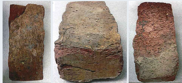
Damage on underside of bricks, not visible from surface