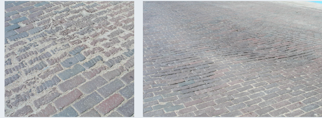
Significant deterioration Horizontal/vertical displacement